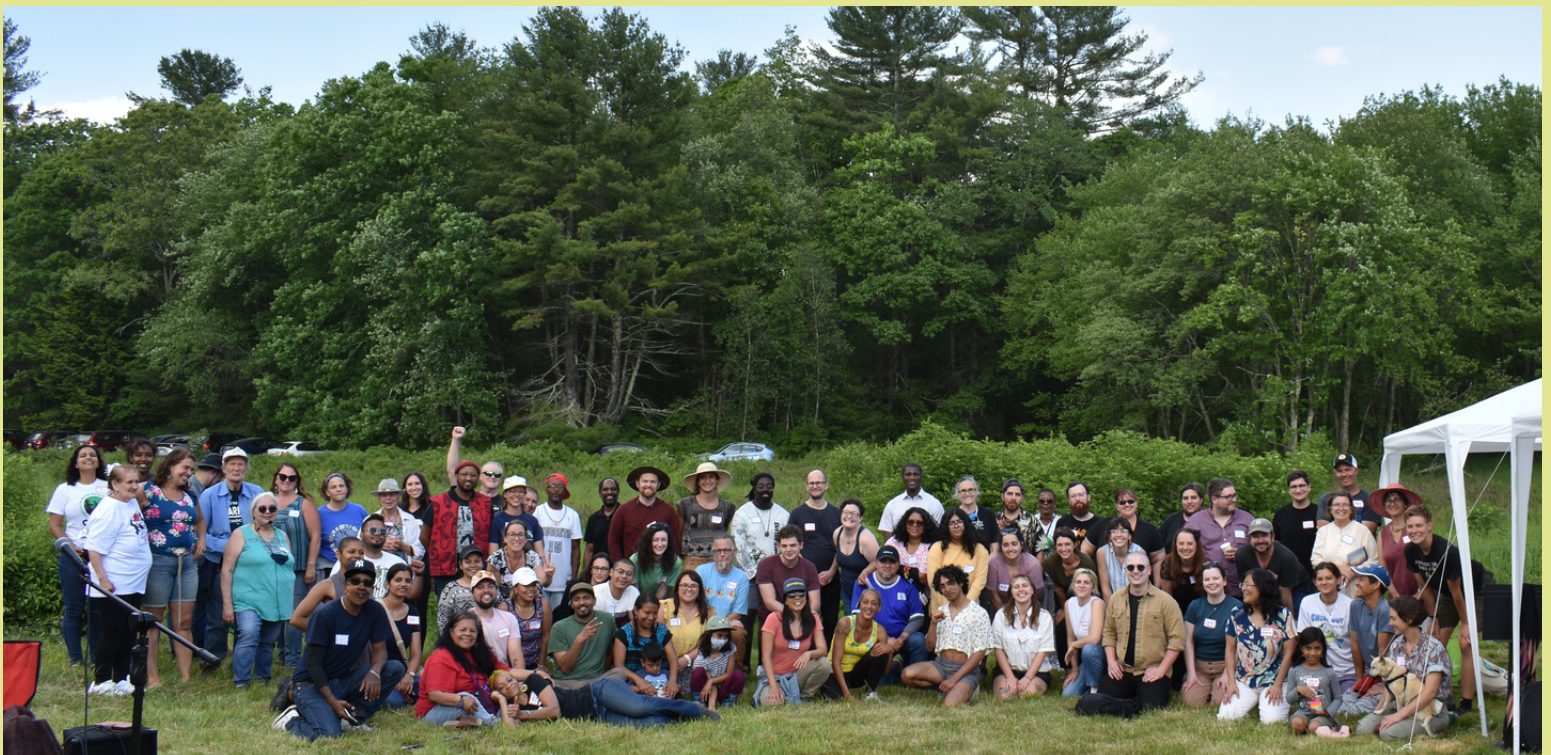
A group photo of Day One attendees