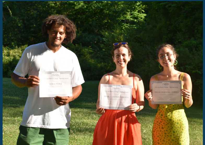
A few of this year's CBC graduates with their certificates at our community cookout and CBC graduation celebration this June.

This year's Co-op Boot Camp had about 15 participants between the two courses. This included participants at all stages of the co-op process: imagining, planning, starting up, working in a new co-op, and running an established co-op. This course offers something for everyone and the popular education model creates space for discussions, role plays, small group work, and presentations to cater to participants' varying needs and interests. We are looking forward to seeing what all the 2022 Co-op Boot Camp participants go on to accomplish!