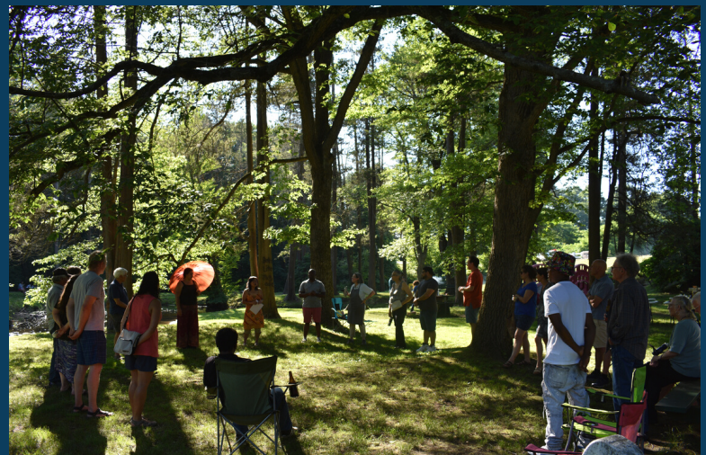
This year's Co-op Boot Camp Graduation and Community Cookout in Springfield's beautiful Forest Park