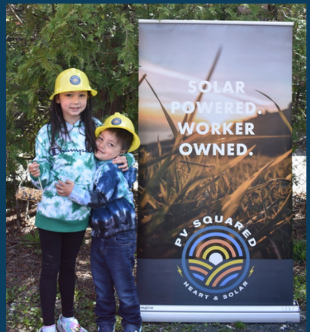
The local Greenfield co-op PV Squared helped sponsor eco-friendly crafts for kids led by Wellspring members

Attendees and participants left feeling hopeful and excited to do this again next year—bigger and better. Wellspring strengthened existing relations and made new connections through this event, and we look forward to the collaborations that will follow.