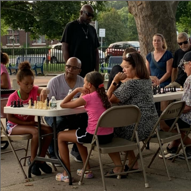
Chess Club meets every Tuesday at the Indian Orchard Citizens Council at 6pm. All are welcome!

Grow IO is part of Wellspring's holistic commitment to supporting a cooperative economy.